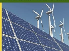
Resort to renewable energy