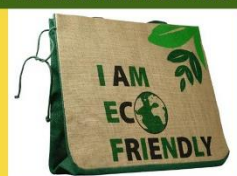
Use Eco-friendly products