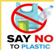
Say no to plastic