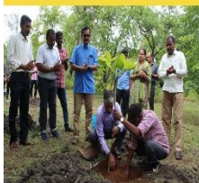
Plant native species