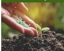
Use bio fertilizers