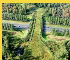
Protect wildlife corridors