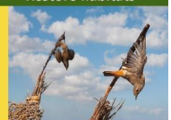
Stop indiscriminate killing and trade