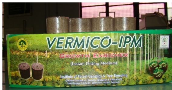
Vermico- IBM Growth Enricher (Instant Potting medium)- released by the Honourable Minister of Shri.Prakash Javadekar, Ministry of environment Forests & climate change, Govt. of India during his visit to Coimbatore on 2 nd Feb’2016.