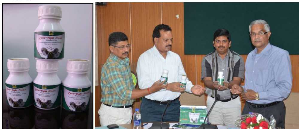
Ento~fight Nasa - released by Dr.Ashwani kumar, IFS, Director General, ICFRE during his visit to IFGTB on 19th November, 2014

Mineral oil based spore suspension of Nigrospora sphaerica @ 4 \times 10^9 /ml is preformulated with suitable adjuvant for field application to protect crop plants from insect pests of defoliator (leaf feeder) in nature.