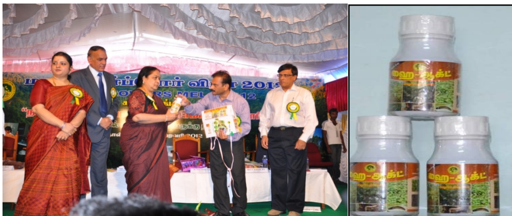
Hy-act - released by Honourble Minister Smt.Jayanthi Natarjan, Ministry of Environment and Forests, Govt.of India in Tree growers mela held at IFGTB during 24-25 th Feb'2012.

History indicates that H.pentandra oil possesses many medicinal properties. But no information on its pesticidal properties is available. Hence, the bioactivity was evaluated on the key insect pests of Ailanthus, Casuarina and Teak. Preliminary study conducted both in the laboratory and field conditions revealed that the oil possesses insecticidal properties against these pests. Hence oil biopesticide formulation was prepared and it showed effectiveness in managing the insect pests in terms of larval mortality; Hyblea punea (80-90%), Inderbella quadrinotata (60-80%) and Eligma narsisuss indica (45-55%). The formulation is also found to act as feeding deterrents, growth inhibitors, repellents (or) oviposition inhibitors against the target insect species.