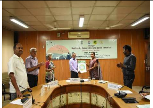
Distribution of LiFE Mission poster to the participant