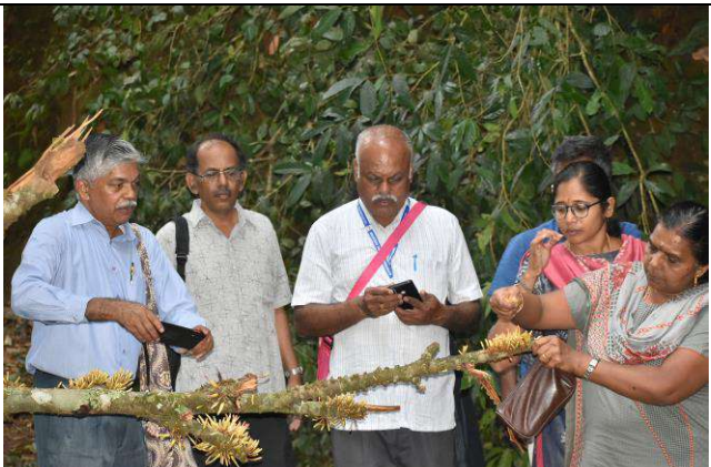
Field Visit to Silent Valley National Park, Kerala