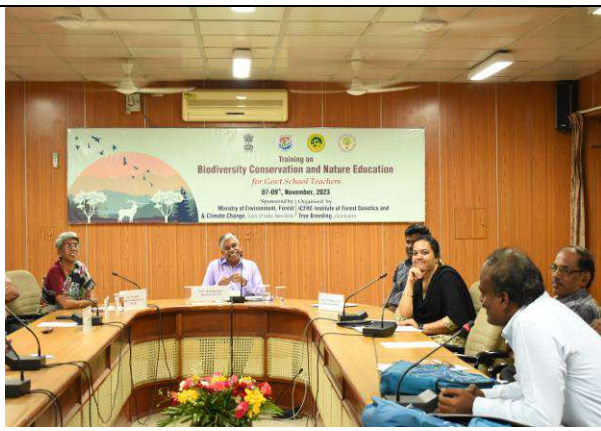
Feedback by the participant