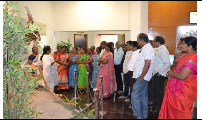
Visit to Insect Museum TNAU, Coimbatore